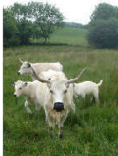
Photo: Devon WildBle Trust's Working Wetlands Herd

The Grazing Advice Partnership (GAP) is pleased to announce the opening of a free-to-enter photographic competition aimed at celebrating the role that native breeds of farm livestock play in conserving our natural environment, landscape and cultural history.