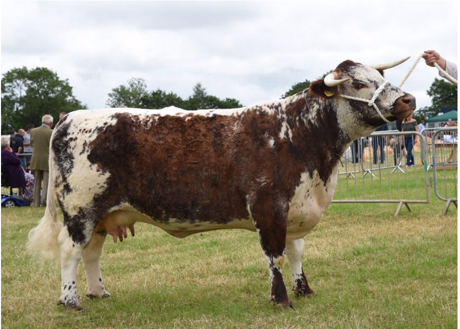
Blackbrook Sabrina, Interbreed Champion Ashby Show, Breed Champion Rutland