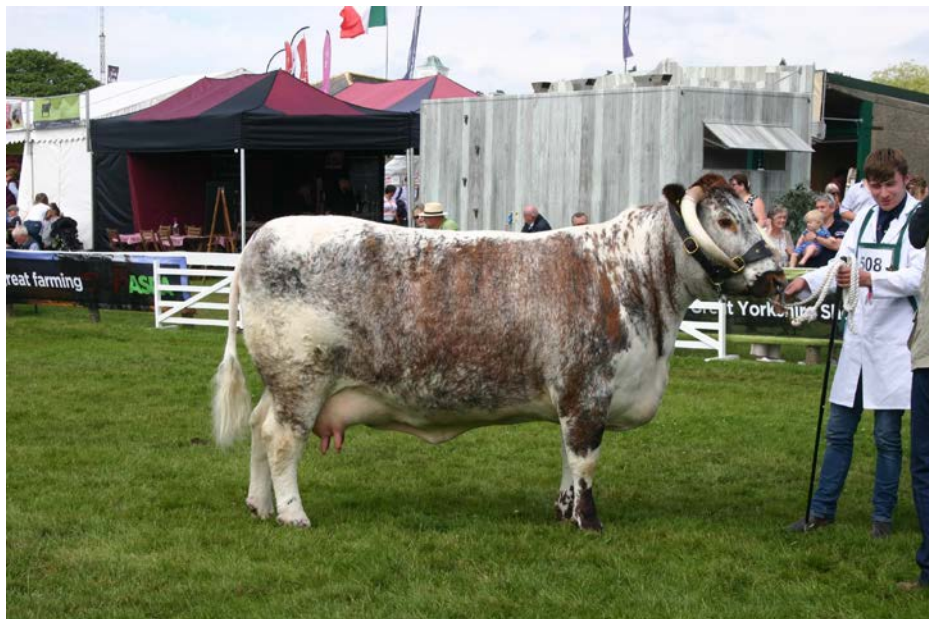
Southfield Lace, Breed Champion Great Yorkshire Show