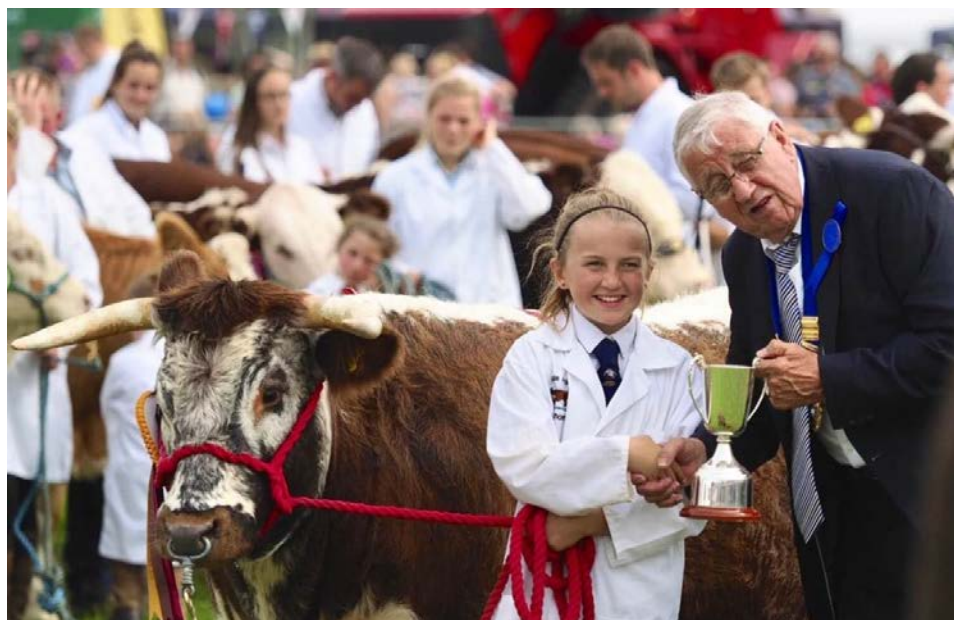
Gale Farm Rona, Breed Champion Garstang Show.