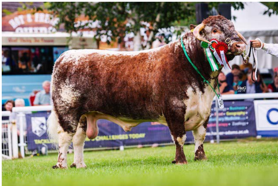
Pointer Diamond King, Breed Champion Royal Three Counties, Reserve Breed Champion Royal Welsh