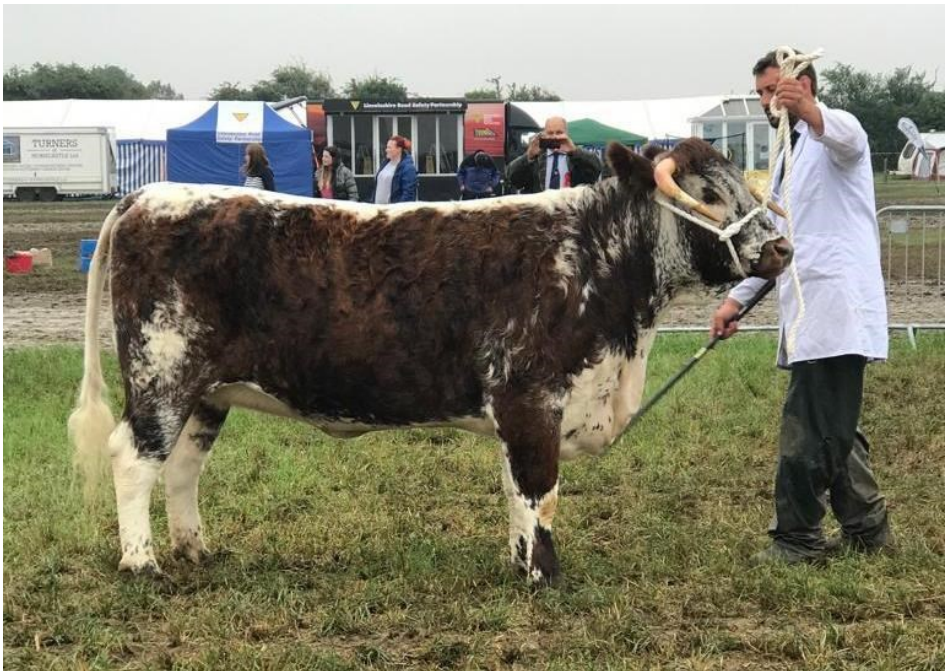
Melbourne Park Fizz, Breed & Reserve Interbreed Champion Heckington, Breed Champion Ashbourne & Hope Shows