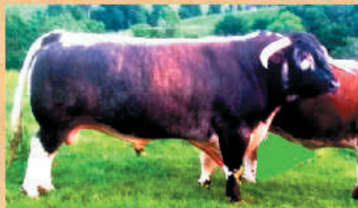
Fishwick Philanderer Senior Sire at Fishwick 2020-2021-2022-2023