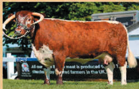
Fishwick Superstar Breed Champion 2021 Great Yorkshire Show