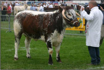
Mayhill Fantasy, Breed Champion, Royal Welsh Show