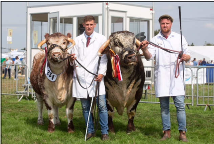
Gentons Qasim & Pointer Can Dance. Reserve Breed Champion and Breed Champion, Moreton in Marsh Show