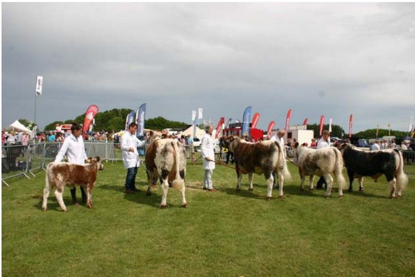
Championship line-up, Rutland County Show