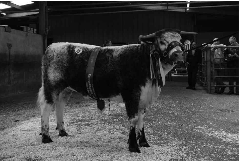
Reserve Champion Gentons Sole

The Trustees are now looking ahead to the Autumn Show and Sale at Newark on 26 October.