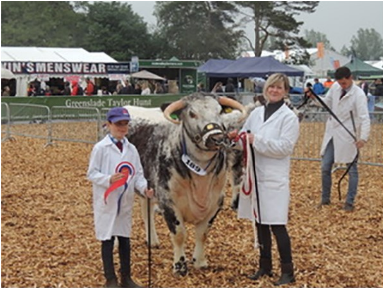
Carreg Rye Grass, Breed Champion, Royal Bath & West