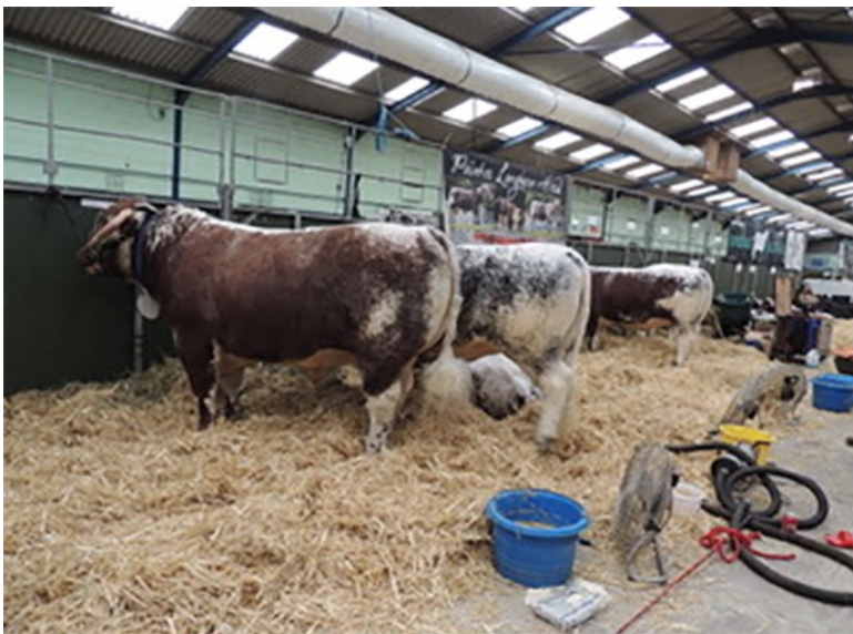
Royal Bath & West cattle lines