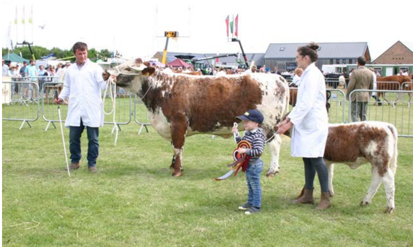
Blackbrook Zabrina, Breed Champion, Rutland County Show