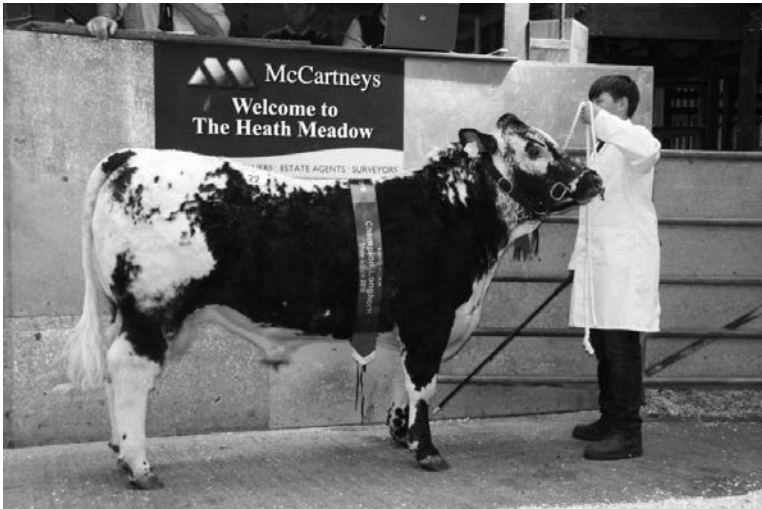
Breed Champion Southfield Spitfire