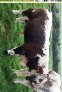
***** Macavity son Polar Star as a calf