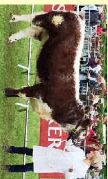
Macavity daughter Fishwick Petula