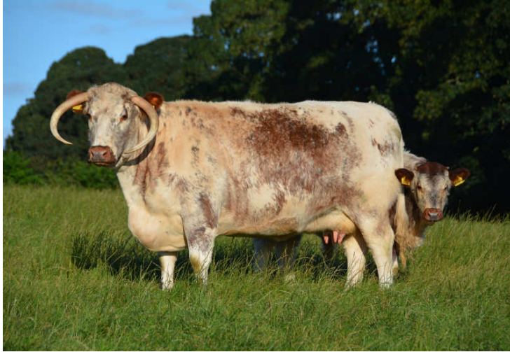
Blackbrook Verity with her calf Blackbrook Axiom