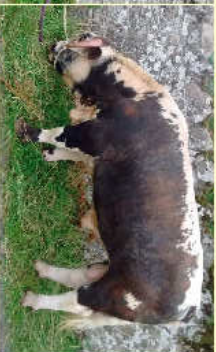
Fishwick Polar Star