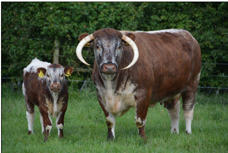
BLACKBROOK VESPER (top) born 22/02/2011 BLACKBROOK WHATNOT (below) born 12/03/2012

John and Pat Stanley, Springbarrow Lodge, Swannymote Road, Grace Dieu,