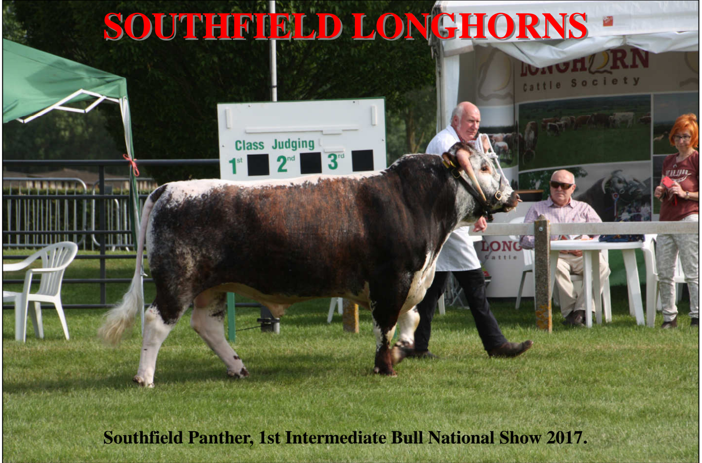
Southfield Panther, 1st Intermediate Bull National Show 2017.

Southfield Farm, Fieldhead Lane, Drighlington, Bradford, West Yorkshire, BD11 1JL 07831-857736 david @davidblockley.co.uk