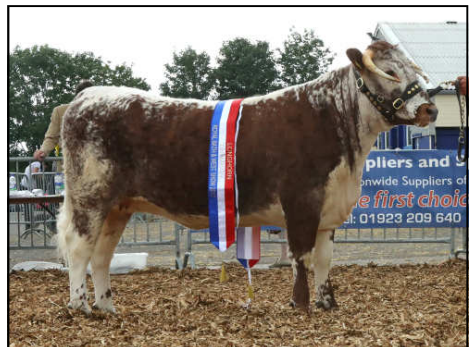
Gorse Winegum, Breed Champion, Royal B&W