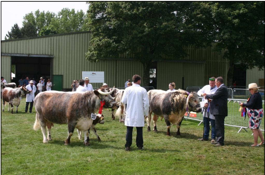
Breed Champion (r) Riverlands Oink, Reserve Champion (l) Fishwick Kanara