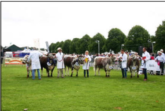
(left) top five in the senior heifers (r-l)

More photos on the website, and if you have any photos, please send them to secretary@longhorncattlesociety.com .