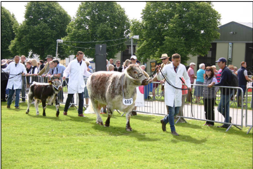
National Show Best Cow, Gorse Quesnelia