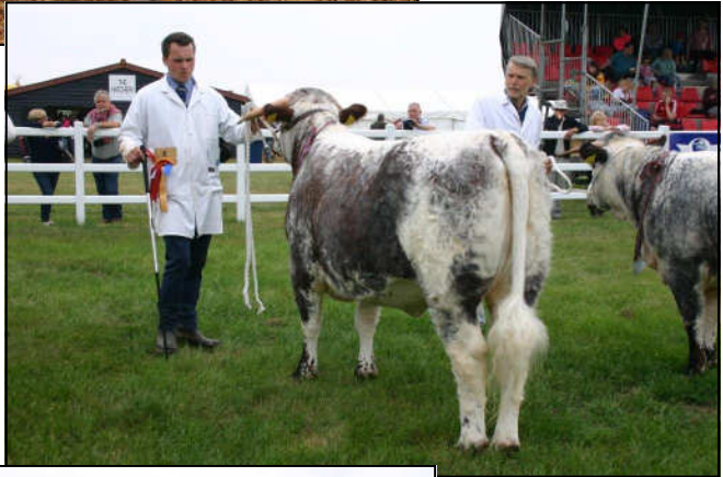
Suffolk Show Champion Trelawny Quince (AK Clark & Sons)