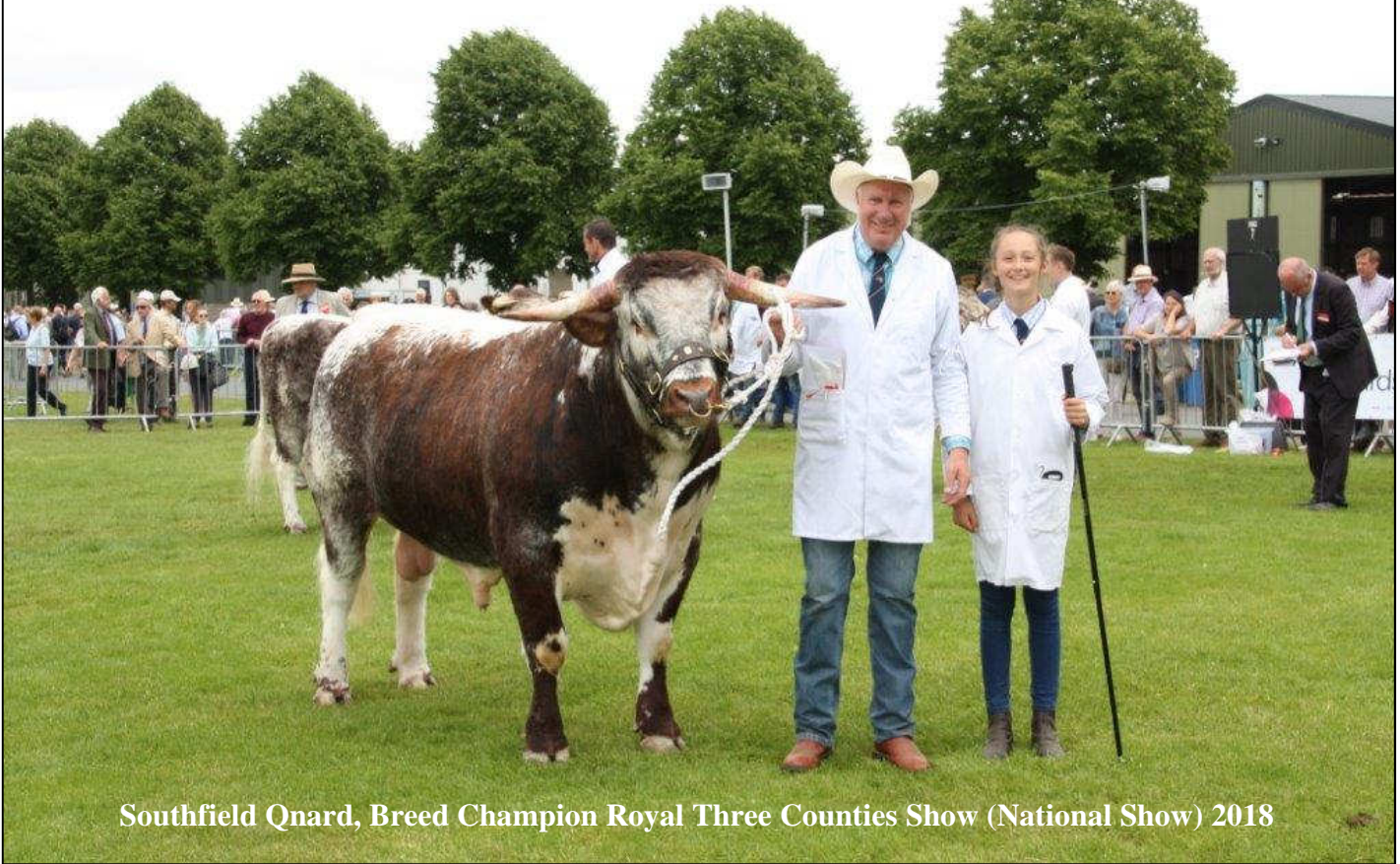
Southfield Qnard, Breed Champion Royal Three Counties Show (National Show) 2018

Southfield Farm, Fieldhead Lane, Drighlington, Bradford, West Yorkshire, BD11 1JL 07831-857736 david @davidblockley.co.uk