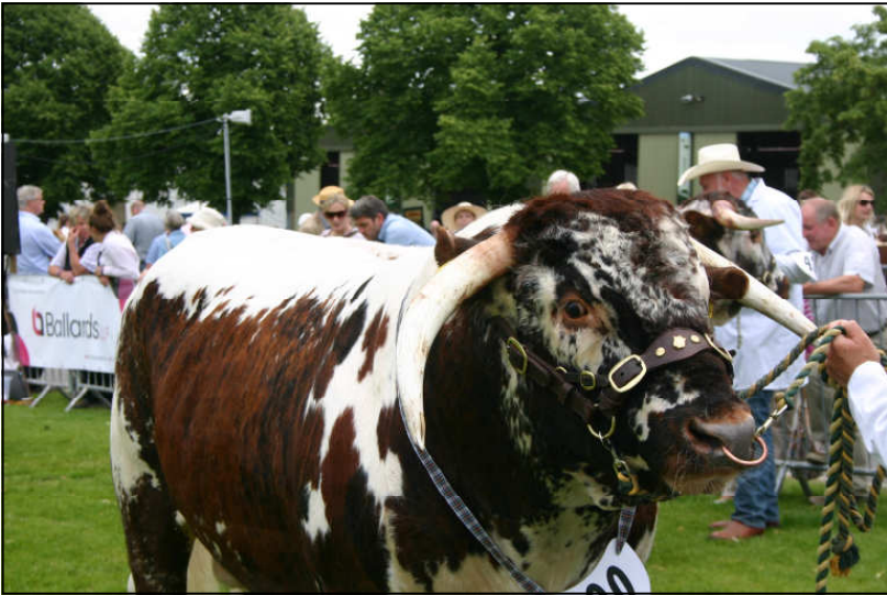
National Show Best Senior Bull, Riverlands Paddington