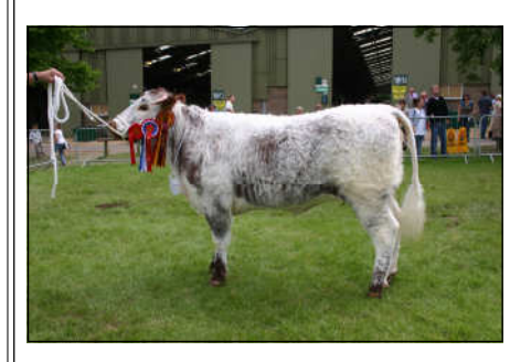
Breed Champion Dunstall Gypsy