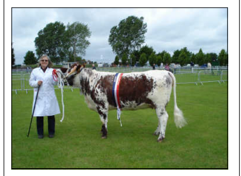
Breed Champion Barlings Greta