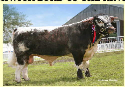
LONGHORN CATTLE SOCIETY BULL OF THE YEAR 2012