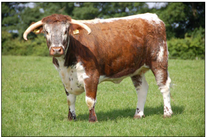
Blackbrook Vesper 21362/L0380 Born 22/02/2011

The Blackbrook Herd has a selection of females for sale