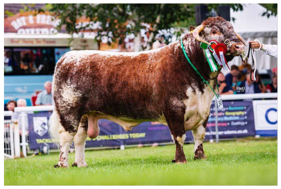
Pointer Diamond King, Breed Champion Royal Three Counties, Reserve Breed Champion Royal Welsh