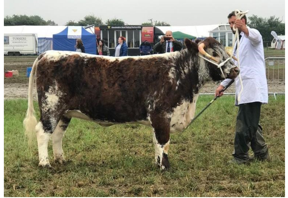
Melbourne Park Fizz, Breed & Reserve Interbreed Champion Heckington, Breed Champion Ashbourne & Hope Shows 22