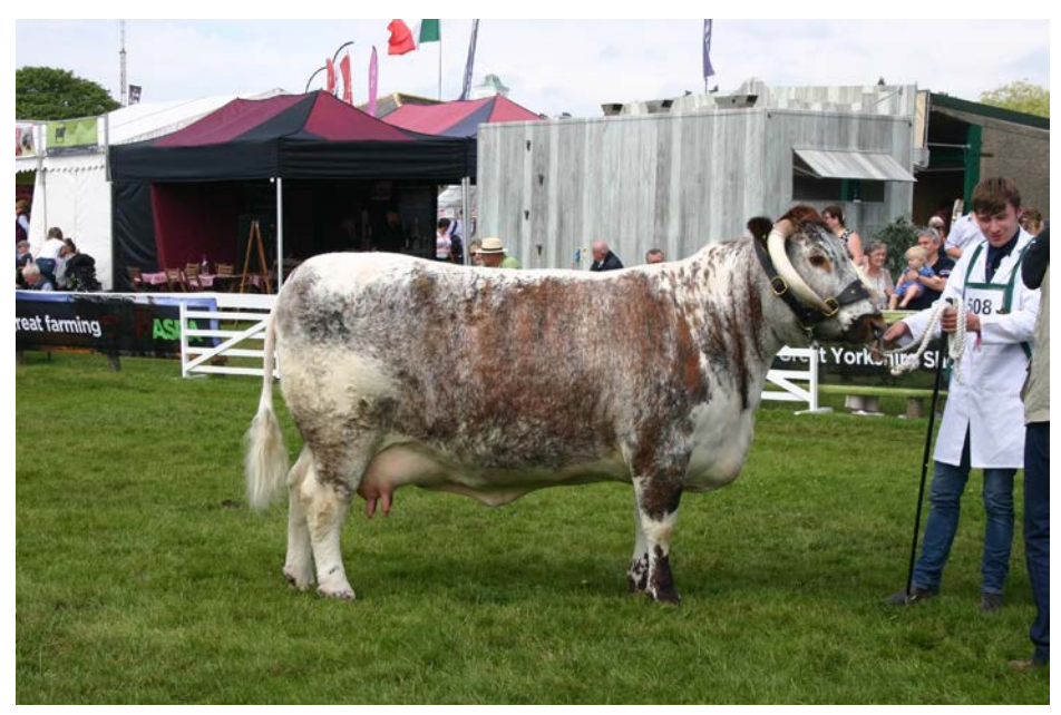
Southfield Lace, Breed Champion Great Yorkshire Show