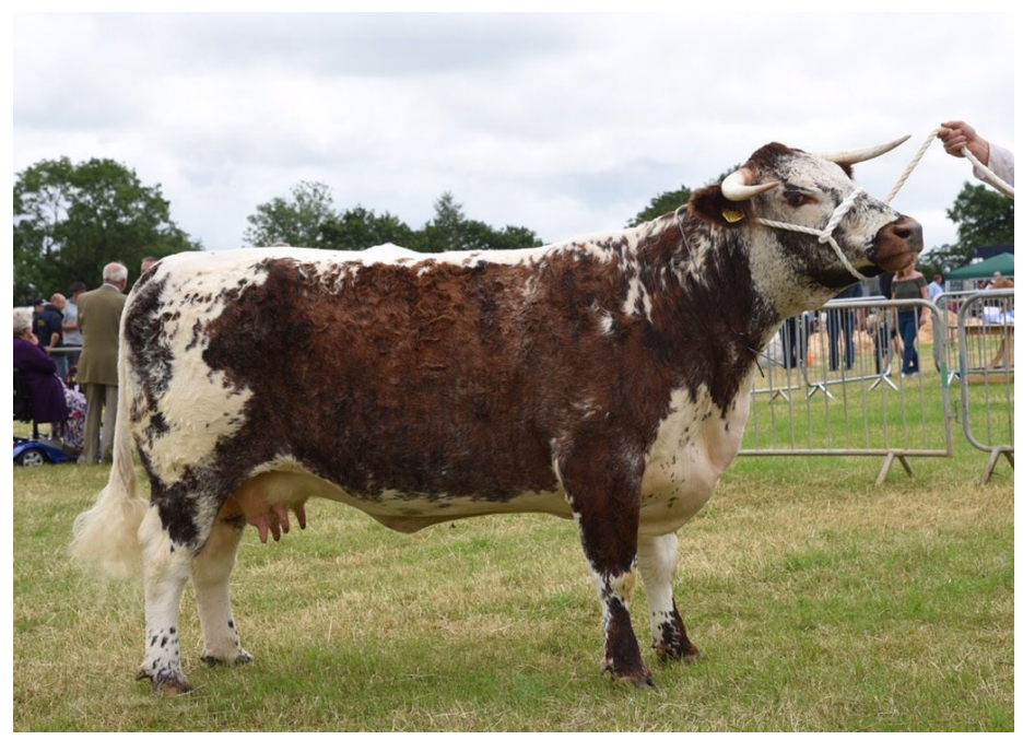
Blackbrook Sabrina, Interbreed Champion Ashby Show, Breed Champion Rutland