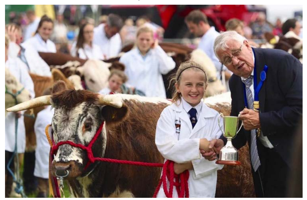
Gale Farm Rona, Breed Champion Garstang Show.