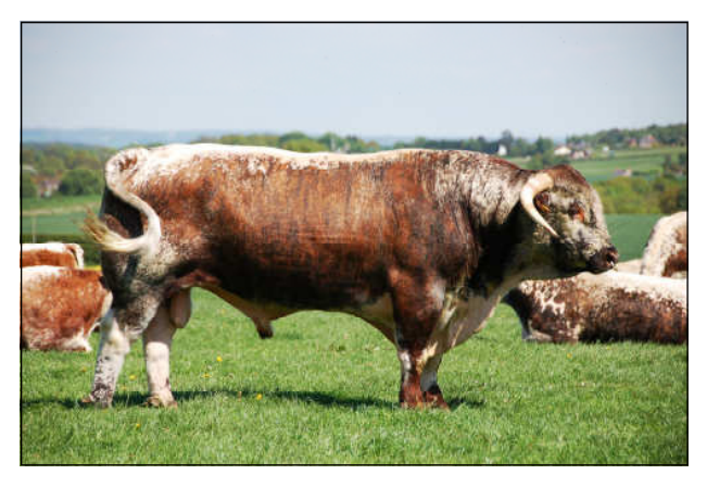
BLACKBROOK TRAPPER 15/01/2009 Senior stock bull in the Blackbrook Herd

The Blackbrook Herd is Hi Health Herdcare Health Scheme accredited for Johnes Disease, BVD and Leptospirosis