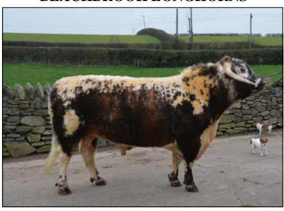
FOR SALE BLACKBROOK X-CHEQUER 26367/N00380 23/01/2013 Sire: Blackbrook Sabre 18015/l0380 Dam: Blackbrook Octopussy 12218/E0380