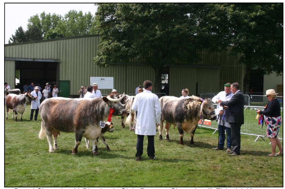
Breed Champion (r) Riverlands Oink, Reserve Champion (I) Fishwick Kanara