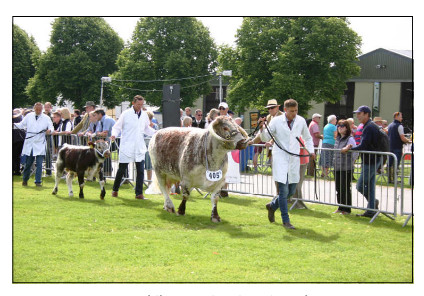
National Show Best Cow, Gorse Quesnelia