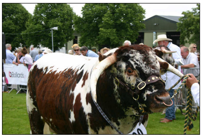
National Show Best Senior Bull, Riverlands Paddington