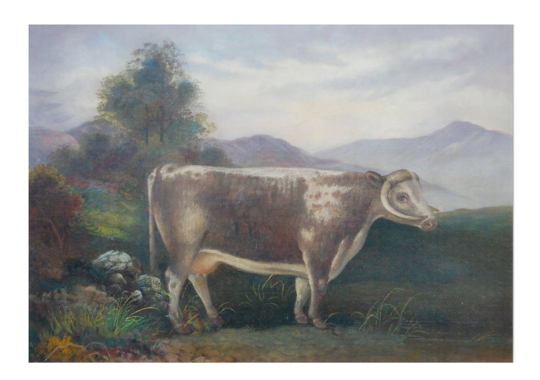
Offer For Sale

Longhorn Cow in extensive Moorland landscape