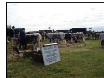
The lines at Ashby Show