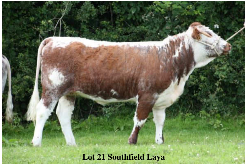
Lot 21 Southfield Laya