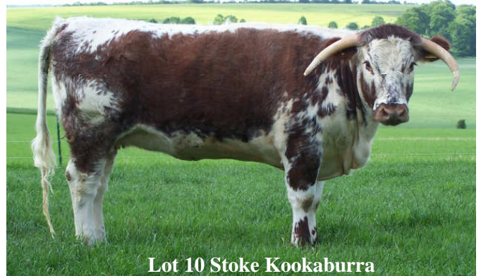
Lot 10 Stoke Kookaburra