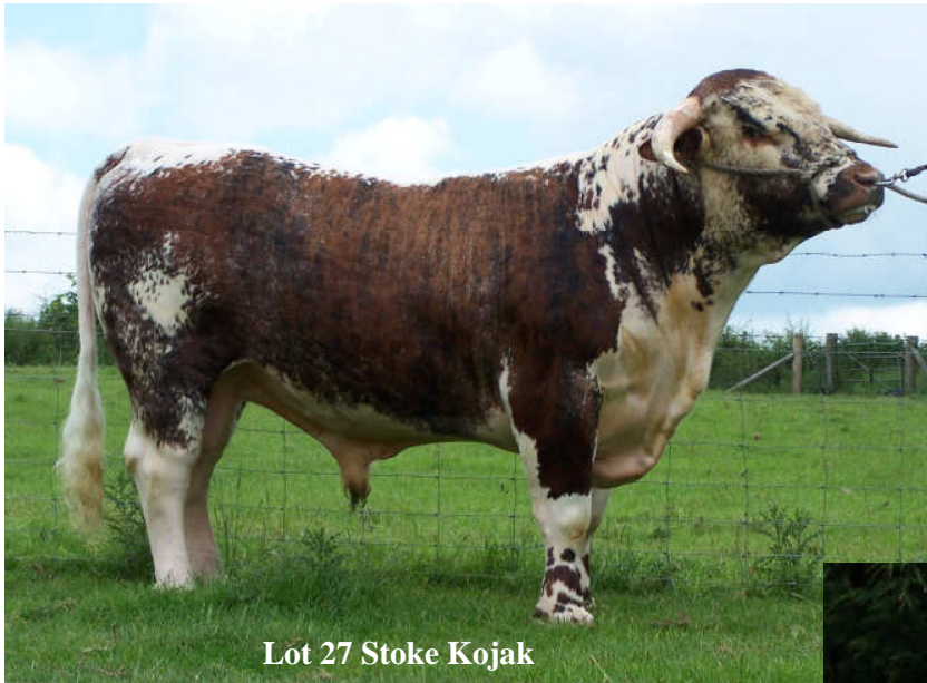
Lot 27 Stoke Kojak