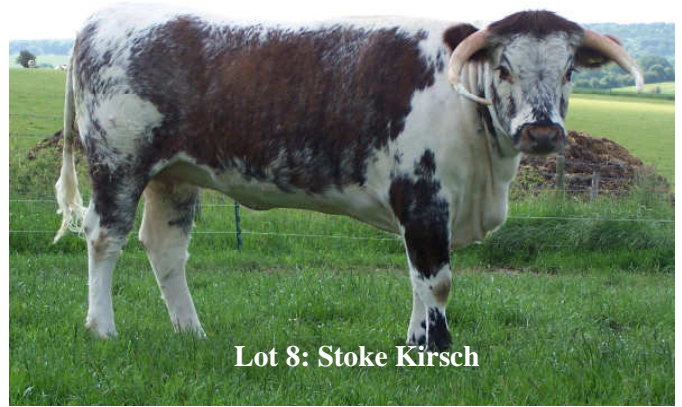
Lot 8: Stoke Kirsch