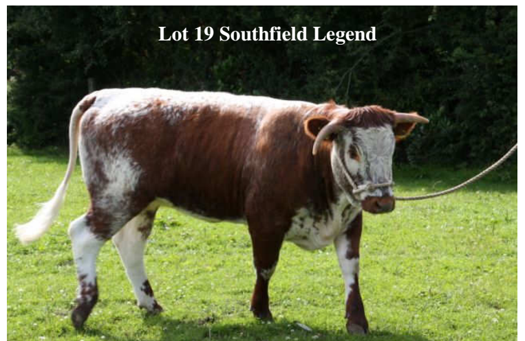
Lot 19 Southfield Legend