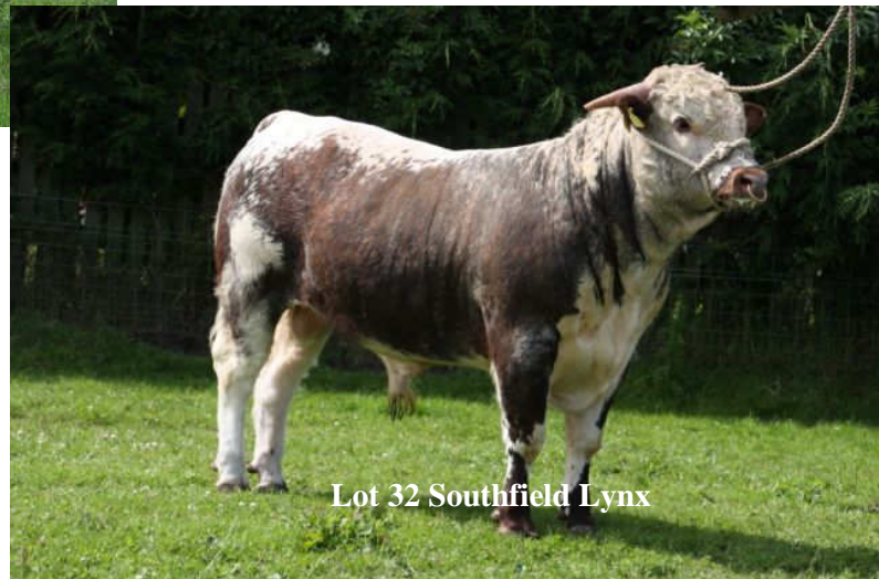
Lot 32 Southfield Lynx