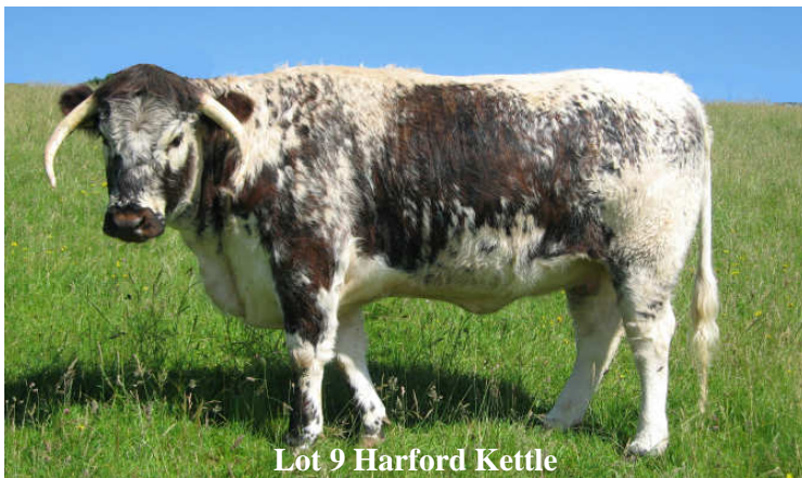
Lot 9 Harford Kettle