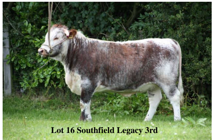
Lot 16 Southfield Legacy 3rd