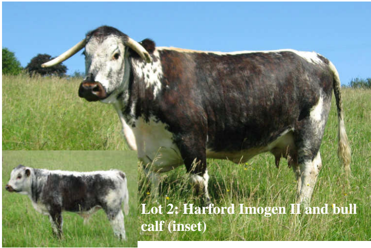
Lot 2: Harford Imogen II and bull calf (inset)