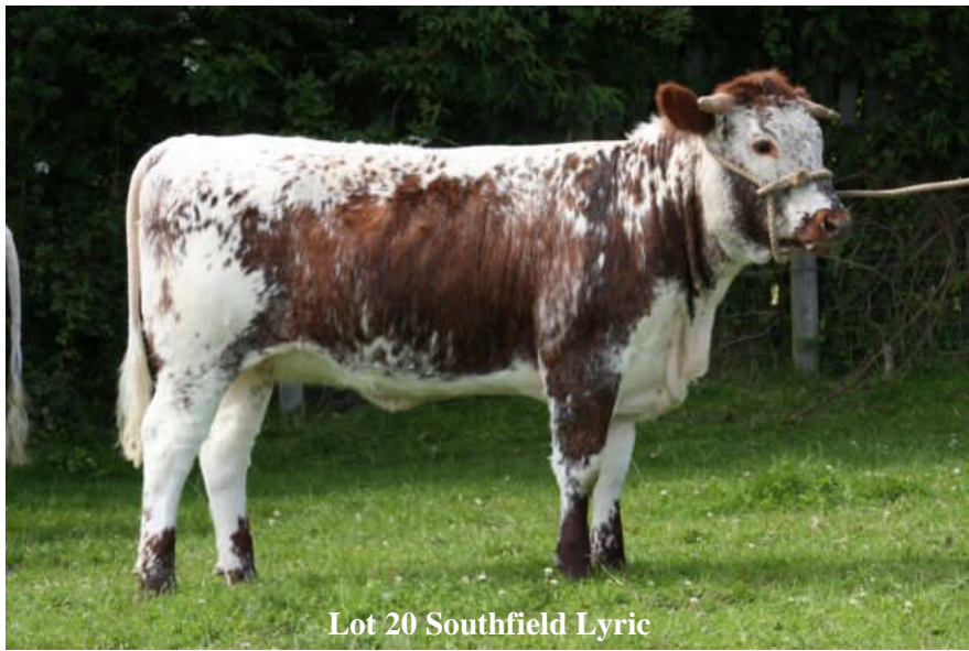
Lot 20 Southfield Lyric