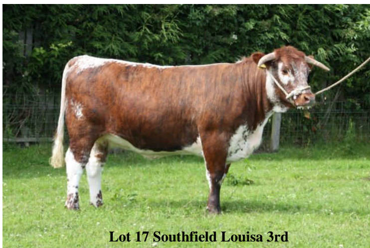
Lot 17 Southfield Louisa 3rd