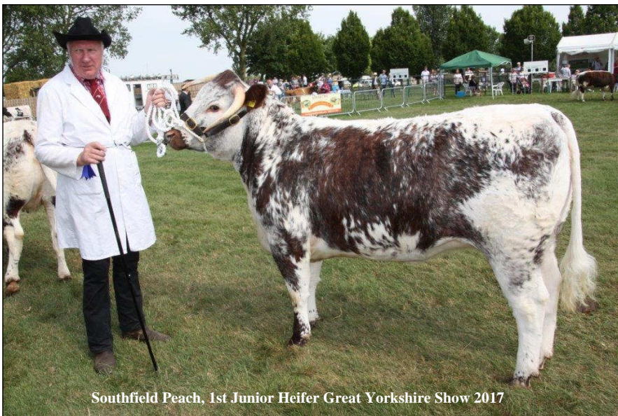
Southfield Peach, 1st Junior Heifer Great Yorkshire Show 2017