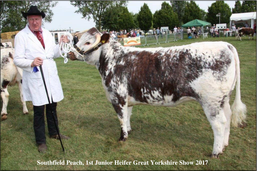
Southfield Peach, 1st Junior Heifer Great Yorkshire Show 2017