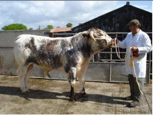
Breed Champion Blackden Nicholas II