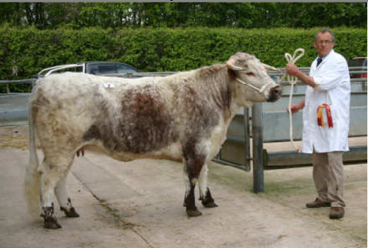
Breed Champion Blackden Mint