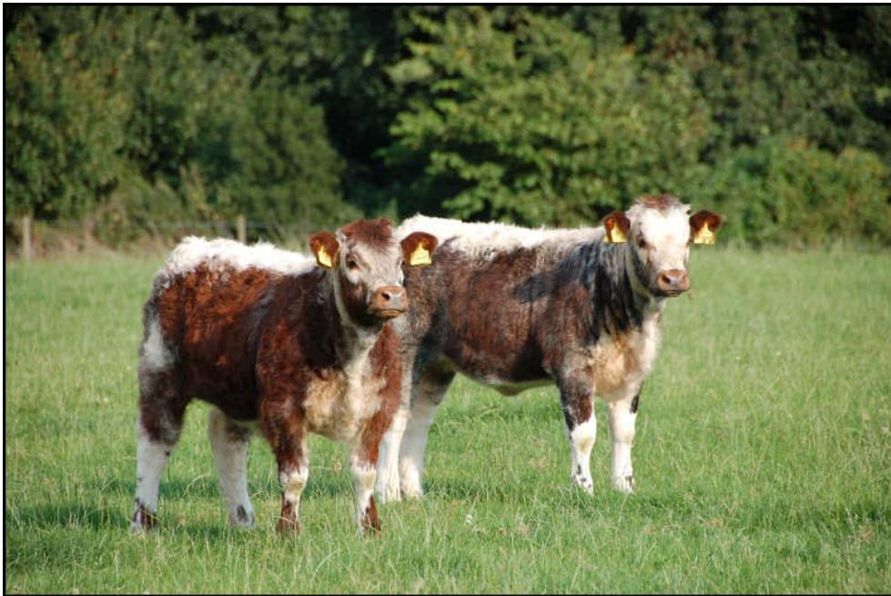
Blackbrook Scarlet and Blackbrook Sabrina